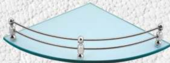
S-121 Corner 9x9, 12 x 12