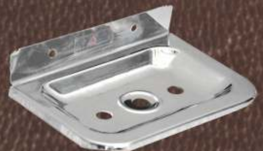
S-131 Round Soap Dish Single / Double