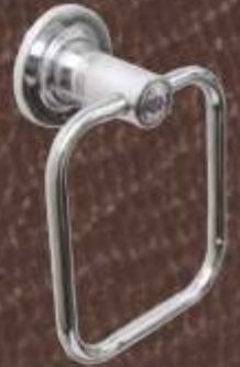
S-130 Square Ring