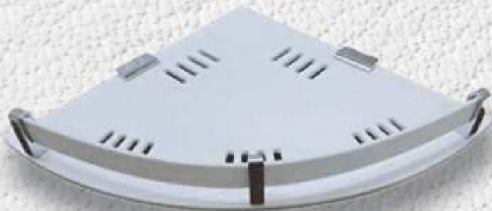
S-119 Corner 9x9, 12 x 12