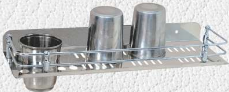
S-115 3 in 1 Shelf Size : 15 x 5