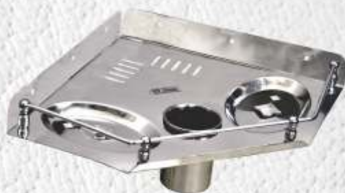
S-116 4 in 1 Corner Shelf