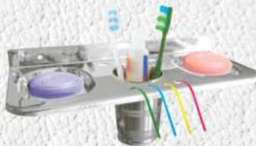
S-117 5 in 1 Soap Dish