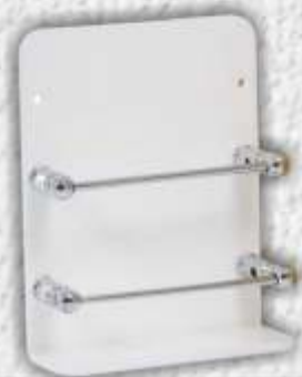
S-120 Mobile Stand