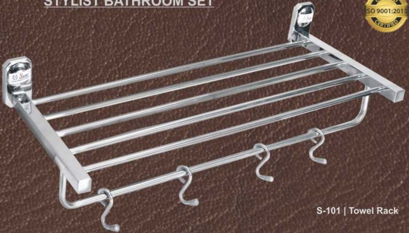
S-101 | Towel Rack