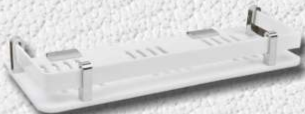
S-118 Shelf 9", 12", 15"