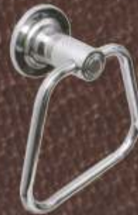
S-129 Apple Ring