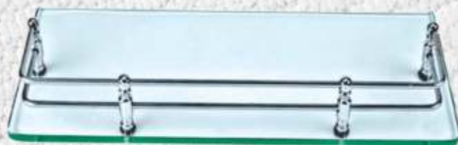
S-122 Shelf 9", 12", 15"