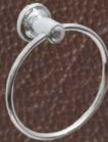
S-128 Round Ring