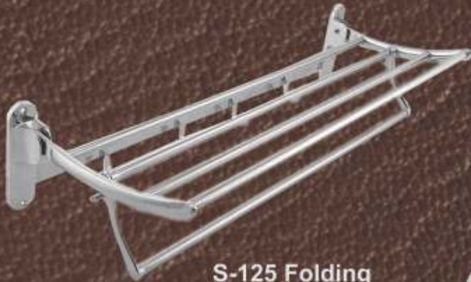
S-125 Folding Towel Rack