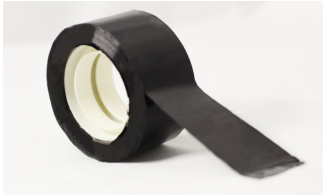
Drip Irrigation Tape