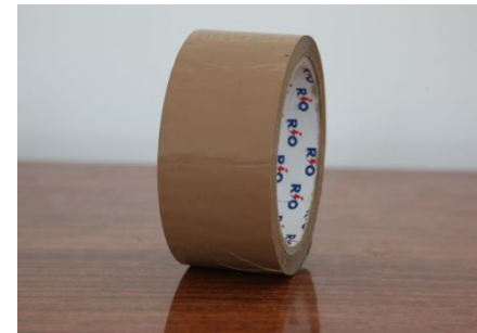
Bopp Duct Tape