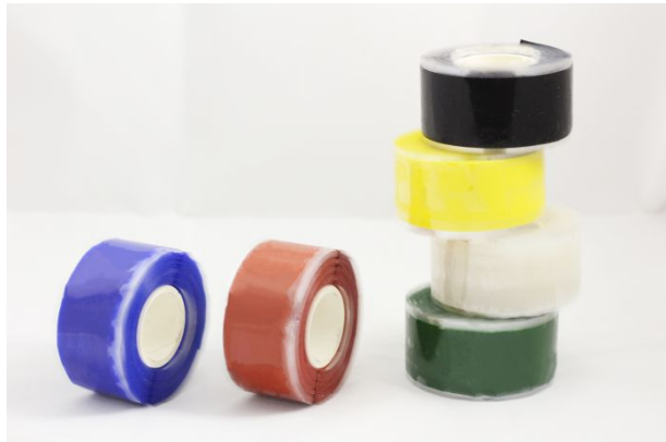
Silicon Rubber Tape / Self fusing Tape