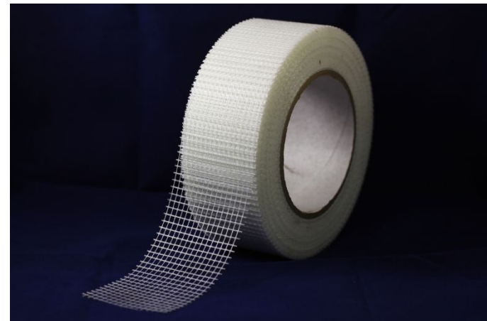
Drywall Fiber-Glass Mesh Tape