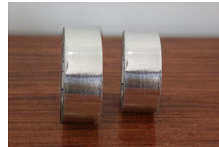
Aluminum Foil Duct Tape