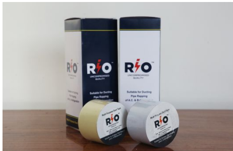
Non Adhesive Duct Tape