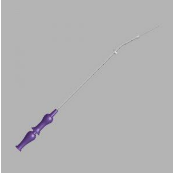
Allwin - Bulb Ultra E T