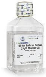
Oil for Embryo Culturing