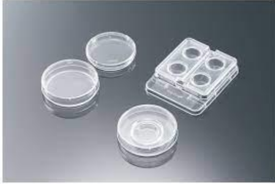
Falcon Disc for IVF.