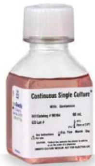
Media CSCM of Irvine Scientific