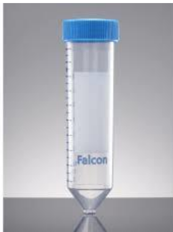
Falcon Conical Tube.