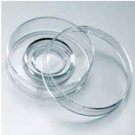
Falcon Central Well for IVF.