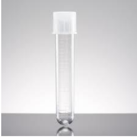
Falcon Round Bottom Tube